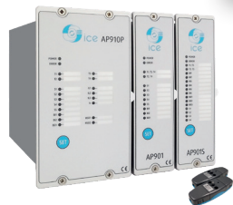
AP900 Arc Flash protection